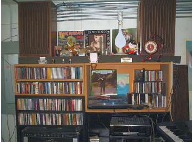
The music altar The two bookshelves evolved into an altar to