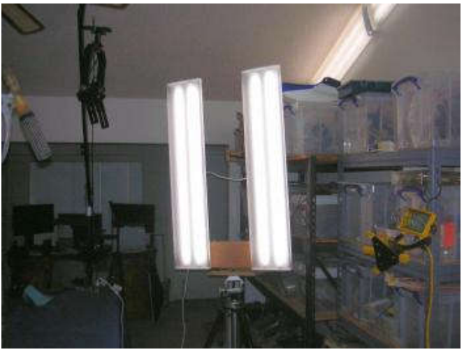
Studio light build

The most recent post: Monday, Dec 26, 2016