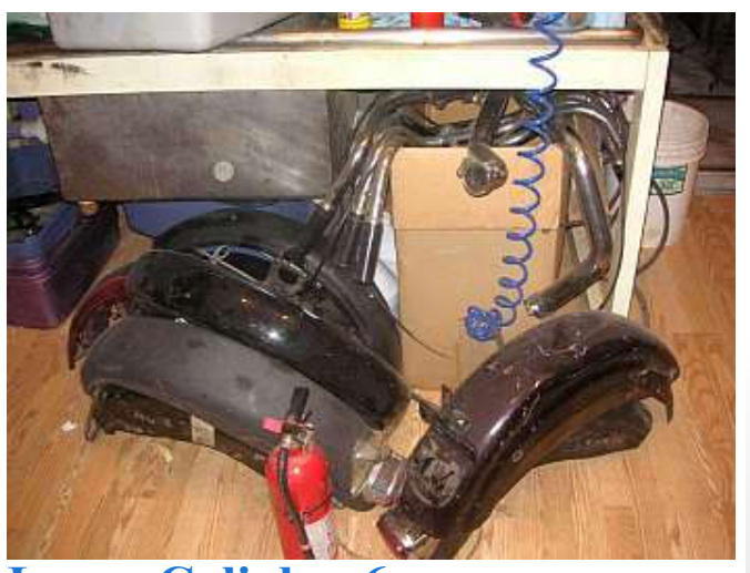
Leave Cali day 6 The move to Florida, Harley parts, oddball junk, and plans.

The most recent post: Monday, Mar 3, 2014