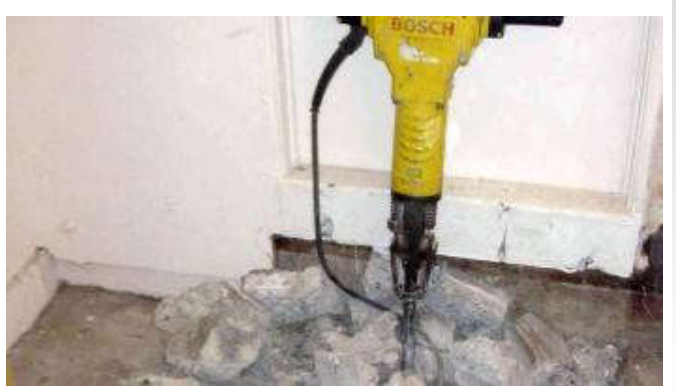
Jackhammer stairs and stumps I rent an electric jackhammer from the Home Depot contractor store. The garage stairs go. Stumps too.

My favorite post: Saturday, Jun 21, 2008