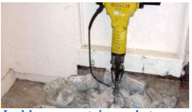
Jackhammer stairs and stumps I rent an electric jackhammer from the Home Depot contractor store. The garage stairs go. Stumps too.

The most recent post: Saturday, Jun 21, 2008