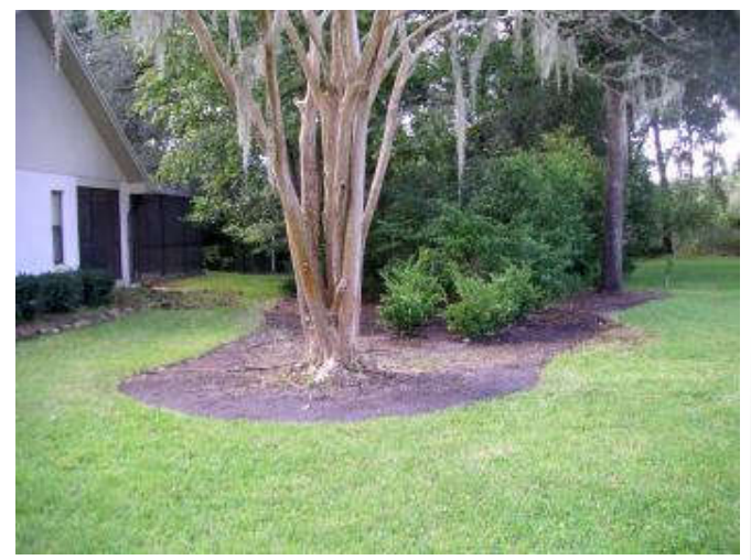
Planting some side-yard bushes I clear out a scrub patch on the side of the house and put in 8 Viburnum and 8 Ligustrum bushes.

The most recent post: Thursday, Oct 21, 2021