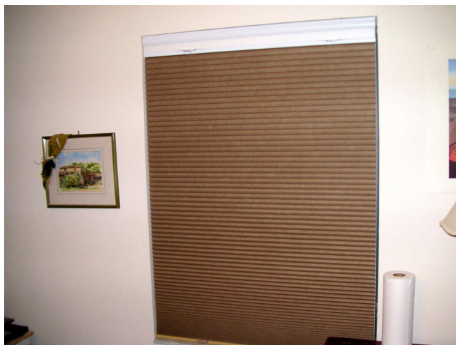
Here the light-transmitting section is folded up, and dark section is deployed.