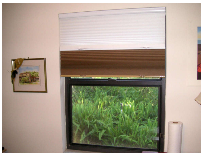
Here the blind is half-and half, part open, part dark and part light.