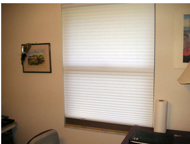
The bedrooms got combo shades that have a light-transmitting section and a dark section.