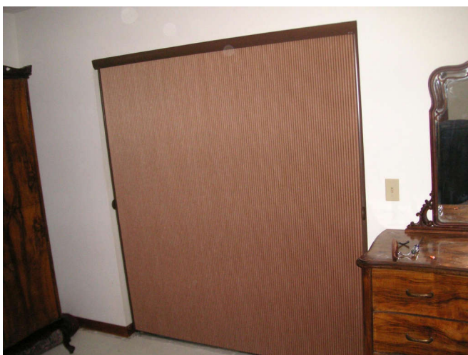
The master bedroom got a light-blocking vertical patio door shade.