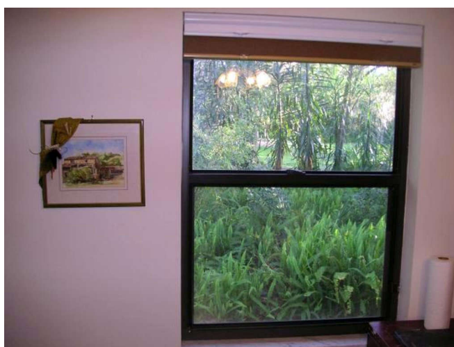
You can pull the blind up all the way and it collapses at the top. There are no cords.