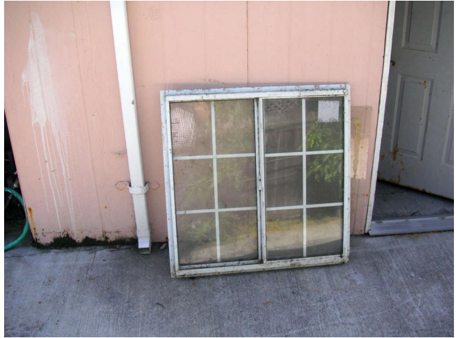
This window was in the side shed when I moved in. Only right is stays when I move out.