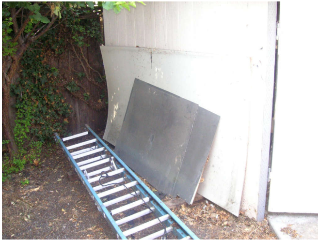
The sheet metal and sheet plastic gets tossed, the ladder made the move to Florida.