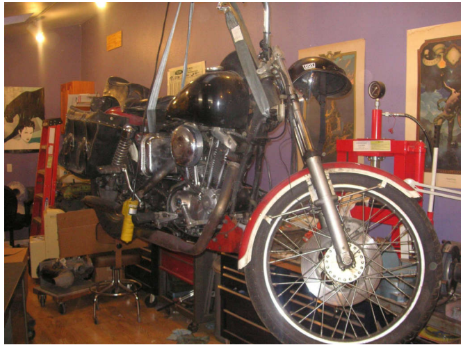
Another view of the 1977 coming down off the desk. It's headed for the garage.