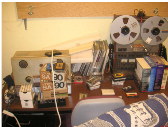
I also have 7-inch and 10-inch tapes to transcribe into the computer.