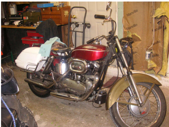
My 1962 Sportster got looked over and was working fine after it blew up last year.