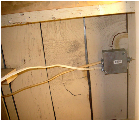
I installed this box in the garage ceiling to make it pass inspection. No exposed splices.