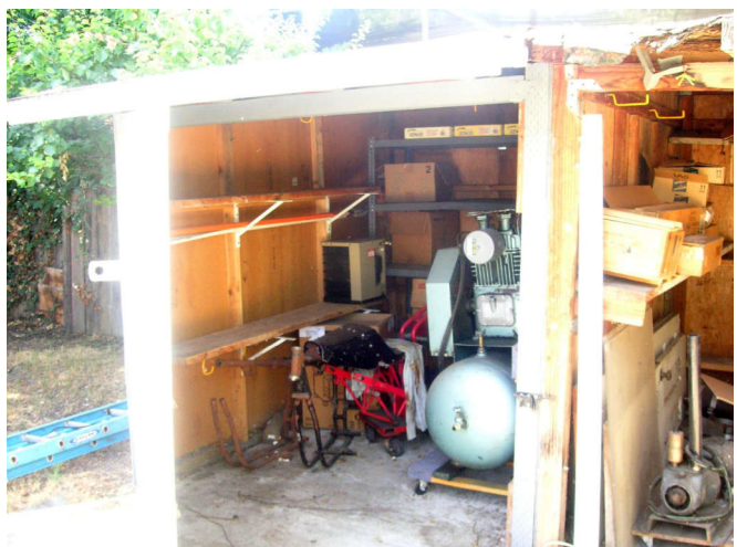
The left side has the Quincy compressor to sell, motorcycle frames to toss, and an air cooler.