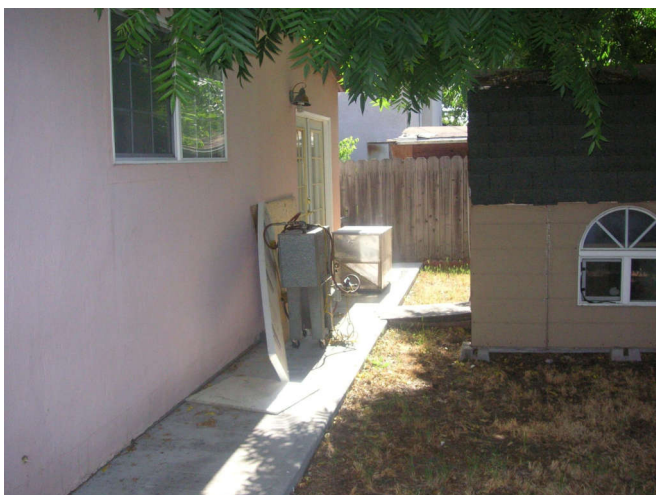
An air cooler and a home-made bead-blast cabinet from the shed are going into the house.