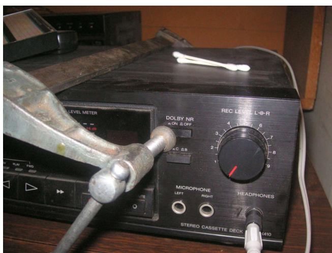
Here is the delicate assembly used to keep the Dolby switch pressed.