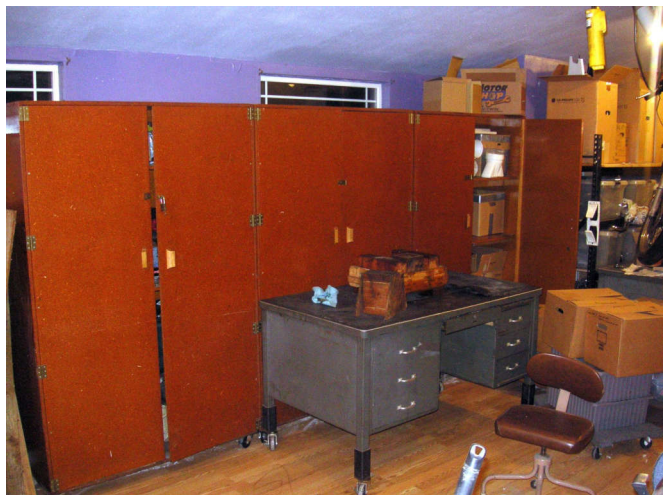
These cabinets made the move to Florida, as did the steel desk. A little progress every day.