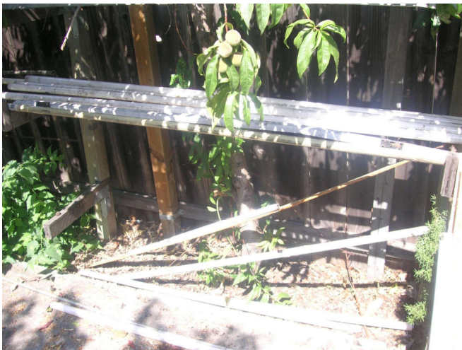
I had a bunch of 8-foot florescent lights I had to dispose of, as well as some pipes.