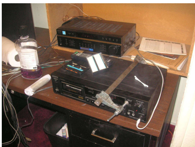
Meanwhile, I had dozens of cassette tapes I was transcribing into the computer. The Dolby switch broke and needed to be held in.