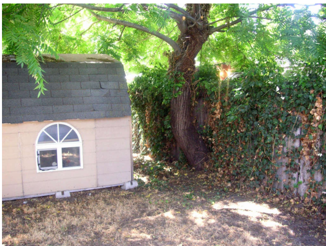
The other shed is cleaned out, and the apricot drying rack behind it is gone.