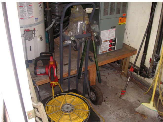
Here is the air-conditioner and hot water heater, with an extension cord on a 35mm film reel.