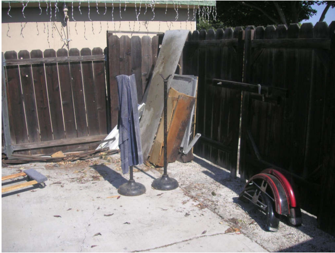
The Jesse Owens memorial squat racks are ready for sale. I think I trashed the fenders.