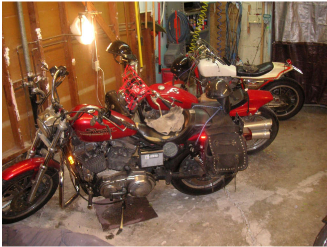
The motorcycles in the garage, The 1977 us coming off the desk to join them.