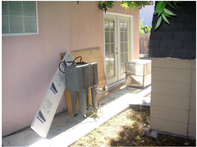
There is some foam left over from when I soundproofed the windows.