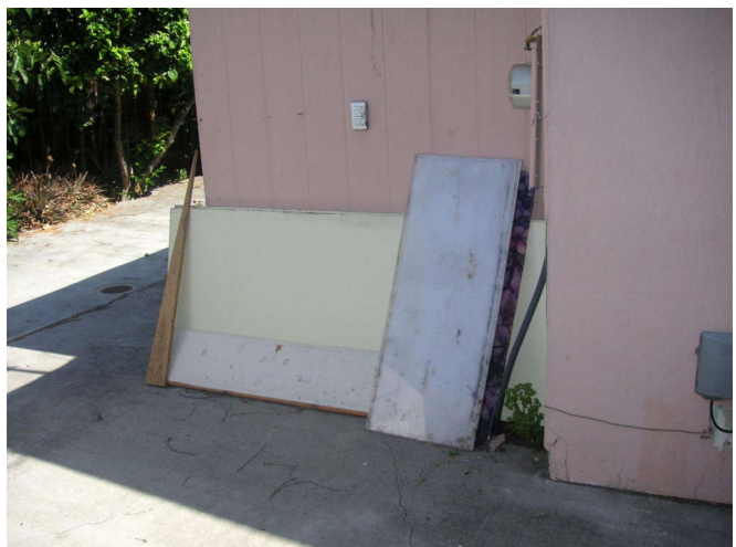
Some more plastic, and I think the yellow are doors for a closet in the house.