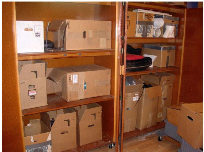
The tanks and other parts are packed up in boxes I had handy. The movers re-packed them.