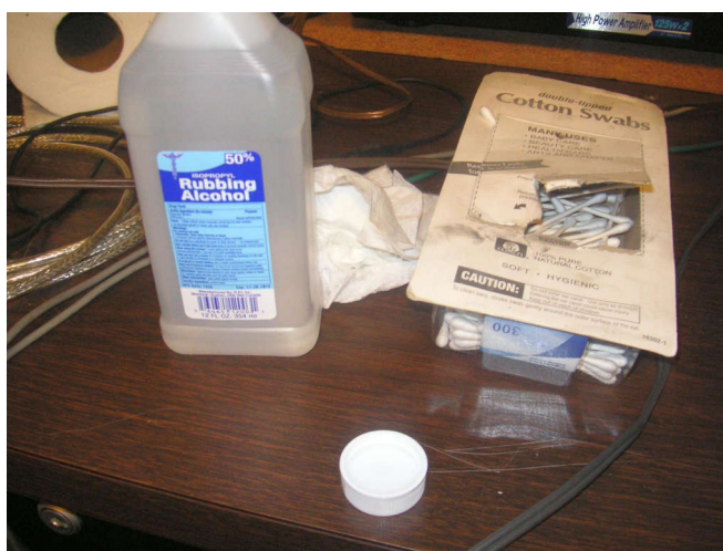
The old tape sheds particles. I learned isopropyl alcohol and Q-tips would clean the heads.