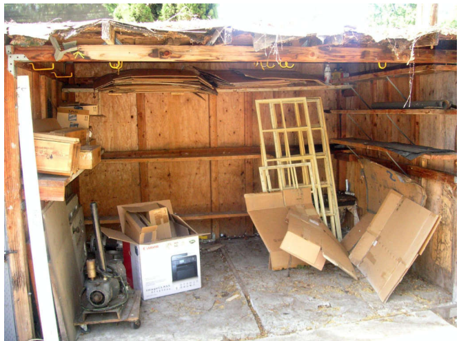
The right side of the back shed is clearing up. Some cardboard has to go, and that pump.