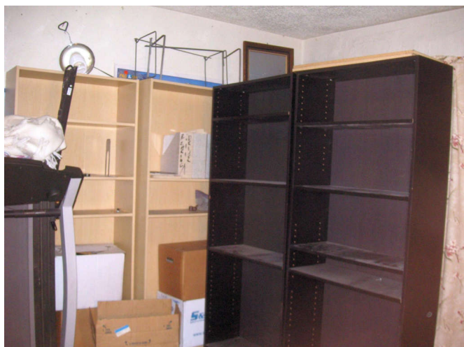
Here are some bookcases in the living room ready for Marty McGrath to pick up.

The next note was about the bedroom I used to record music. There I had to pack what I could pack, remove one metal desk, transcribe tapes into the computer "like a fiend," and give yet more bookshelves to Marty. The bedroom I used as a dressing room had a note to use old clothes for padding in the move, or toss them. For the dining room there was scanning and a fire safe to sort through. The living room had more scanning and those bookcases for Marty. For the shop, I noted to empty the cabinets, cut down the wash sink, make some engine crates, and dump some parts in the "Harley bins".