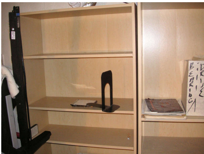
There is still some scanning in that box.