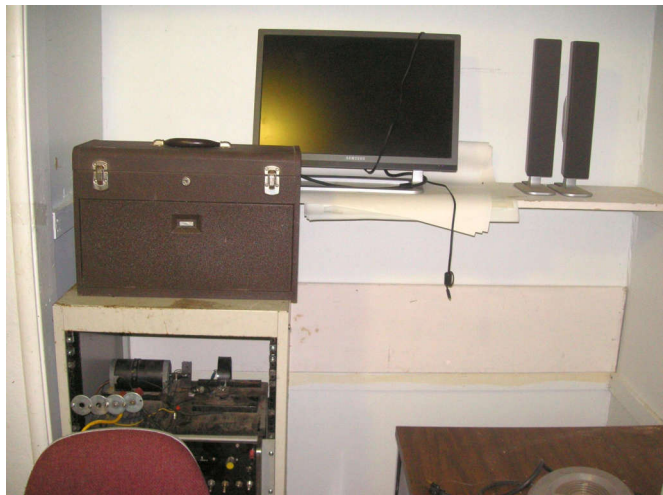
Another view of the lab, All this stuff made the move to Florida.