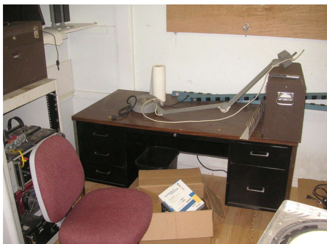
Packing the lab before tossing the desk.