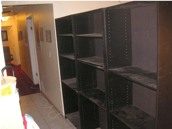
More bookshelves moved from the lab, ready for Marty.