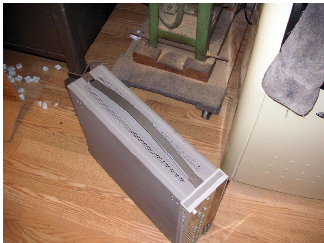
This is an HP 500MHz pulse generator headed for eBay to ship in the box above.

The day before these pictures, the Wednesday at work, I made this list of what I wanted to get accomplished. It starts out with a note to pack up the lab, which you can see in the lede picture. Next was to remove the bookcases, which I gave to Marty McGrath , and to toss out the three metal desks. They went to the curb and were gone by morning.