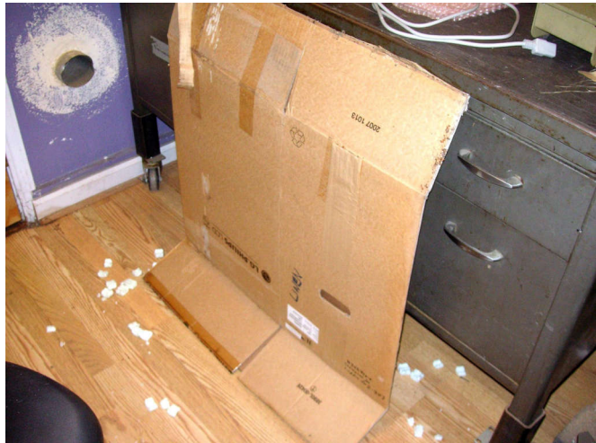
One of the boxes that I used to move in can be re-purposed to ship on eBay.