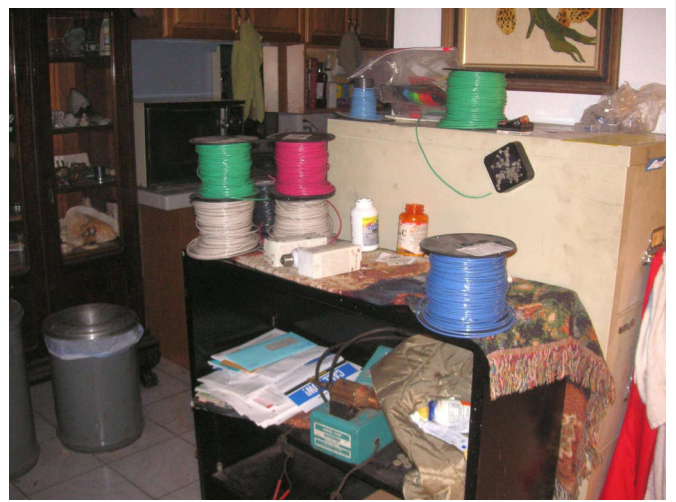
The wire is waiting for Alan Martin to pick up. The bookcase got put on the curb.

the "dining room" has less stuff after the flea market. The desk & bookcase made the move.