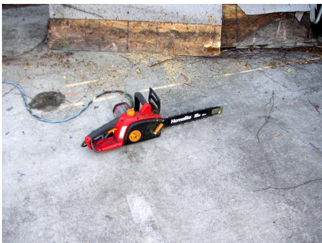
An electric chain saw made quick work of the plywood covered with tar paper.