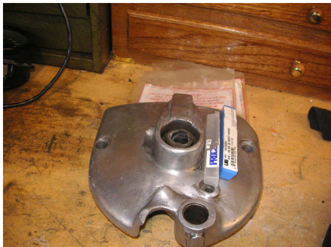
This sprocket cover got put on my 1962 Sportster, yet another motorcycle job to do before the move.