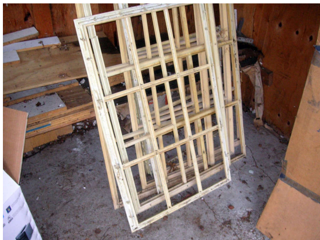
When I boarded up the house to keep the noise down, these window frames went into the shed.