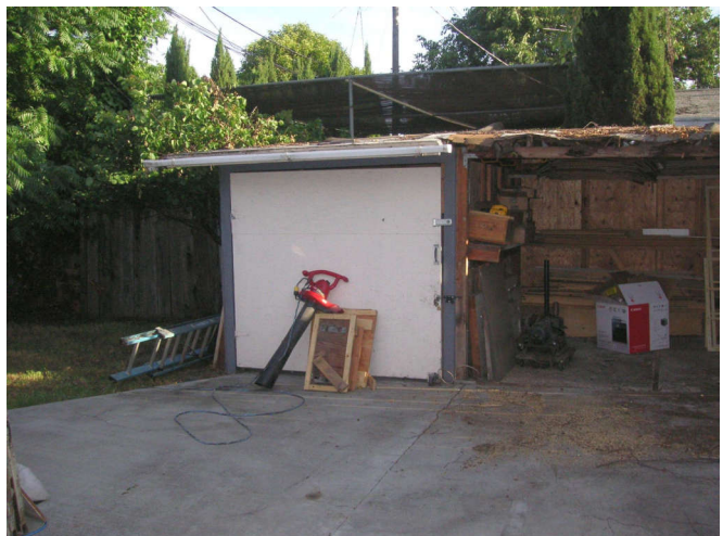
One help was this ac-powered Toro leaf blower that converted to a vacuum. It let me get all the Styrofoam popcorn cleaned up.