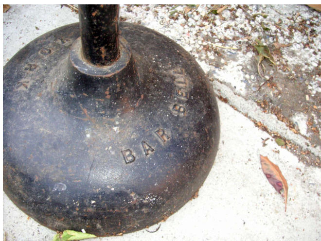
They say "York Bar Bell." It sold on Craigslist.