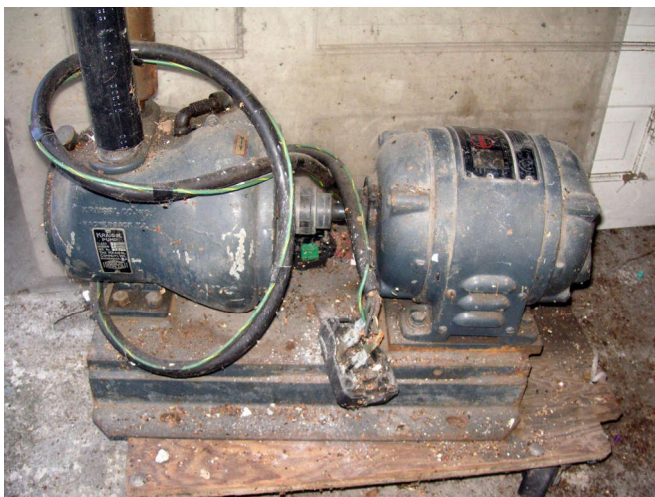
I got the vacuum pump sold on Craigslist.