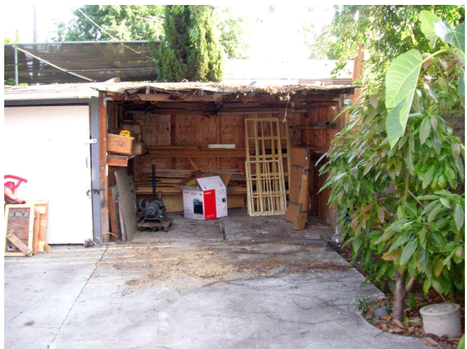
I got the shed cleaned out pretty well.