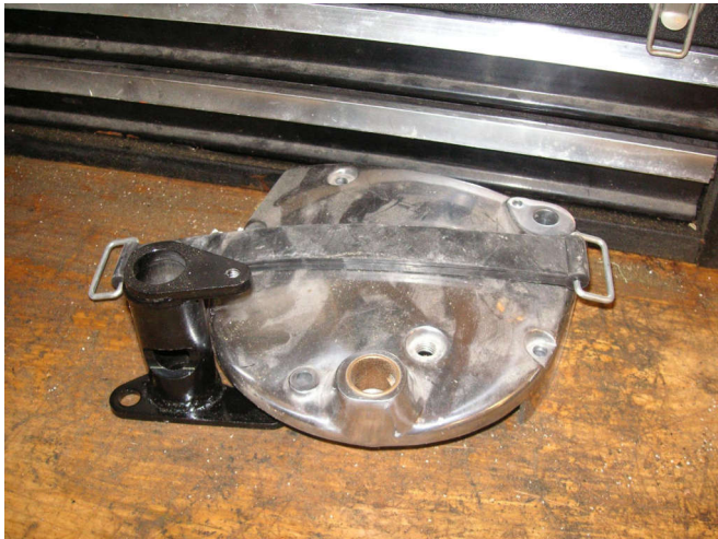
Another bike needed this sprocket cover.