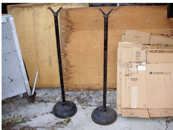
Here are the Jesse Owens memorial squat racks, because Jesse is supposed to have touched them in Cleveland Ohio, where I grew up.