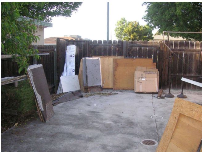
I spread the contents of the shed all over the side yard, to stage it for disposition to the dump, or to sell, or to give to friends.