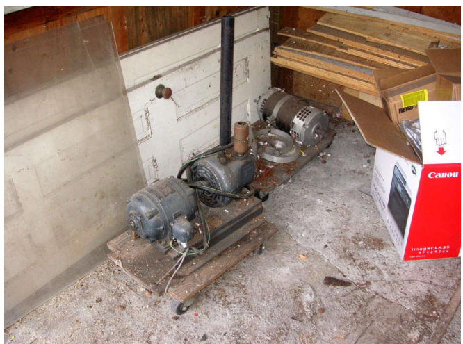
The vacuum pump I sold or gave away. The 9" Advanced DC motor I moved to Florida.