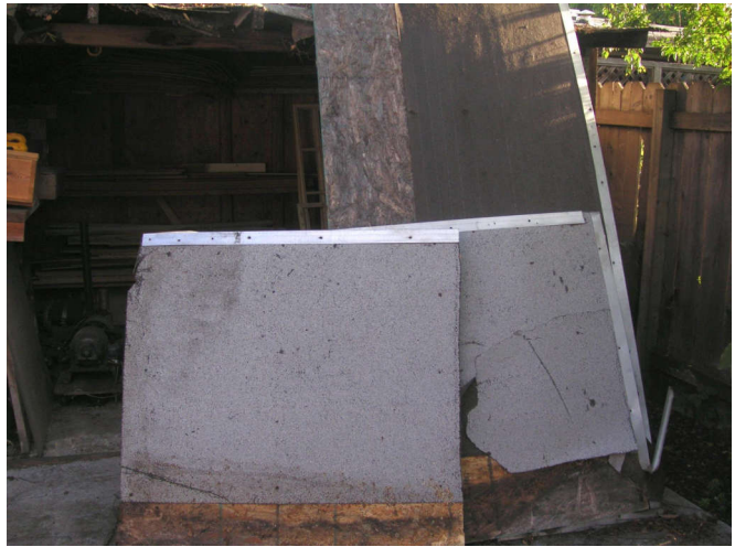
I sawed the sheets up small enough to take to the dump in my 1974 Chevy van.