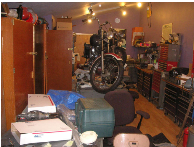
I then turned to the room in the house where I worked on my Harleys. I had to fix two of them to get ready for the move.