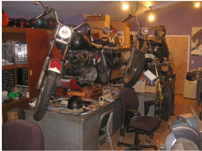
Another view. I got both bikes fixed in time.