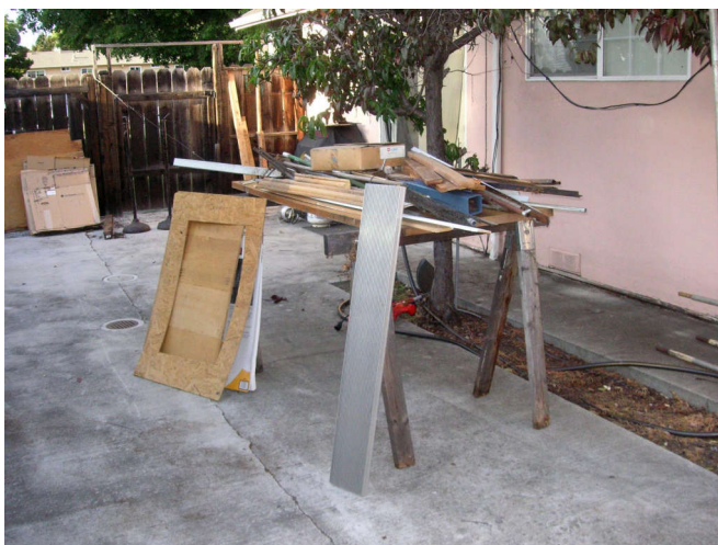
I set up two sawhorses and a door and piled on the junk that was going to be tossed.