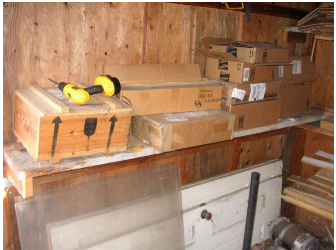
There were plenty of empty boxes to toss..