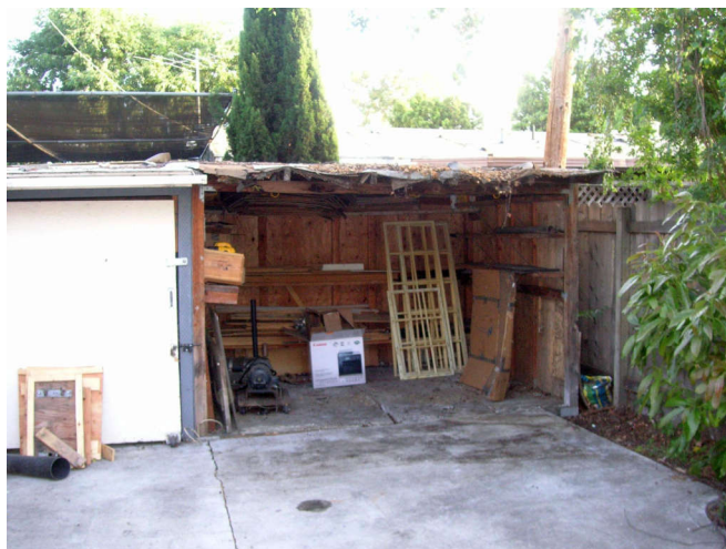
Many times I had to organize things before disposing of them. The shed looks better.