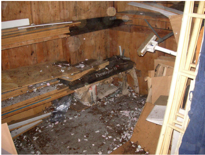
The inside of the shed was littered with shipping Styrofoam and scrap boards.