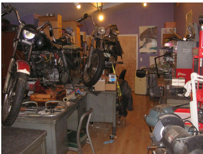
All the toolboxes on the right made the move to Florida.