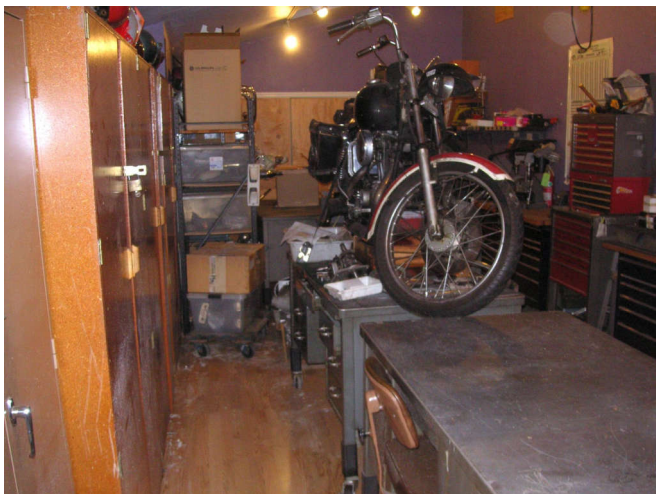
There are a bunch of Harley parts in plastic bins and the wood cabinet. All made the move, a mistake, I should have sold the parts off.