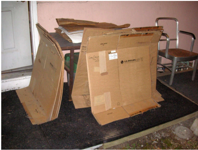
The cardboard went out front for the recycling pickup later in the week.