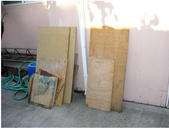
I ended up with plenty of wood to scrap.