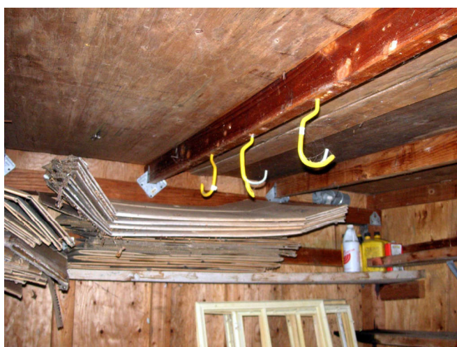
Here are some boxes from the 2008 move.