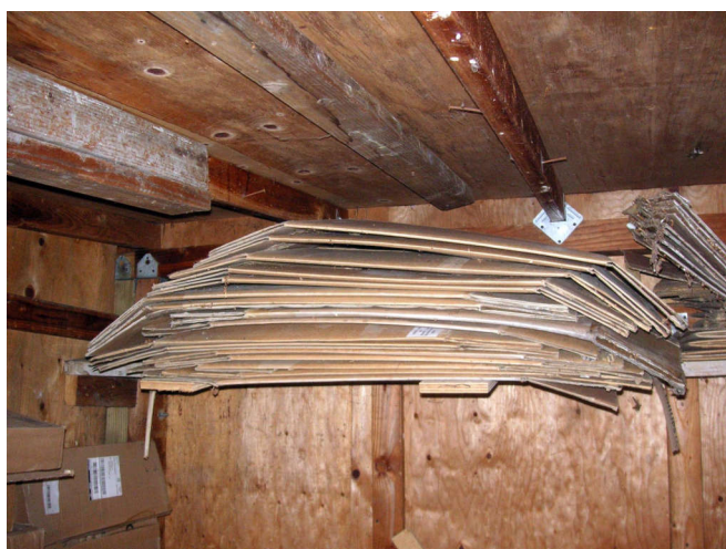
More boxes. The 2008 move was short range, from my shop at 1161 Tasman to this house on Plaza Drive.